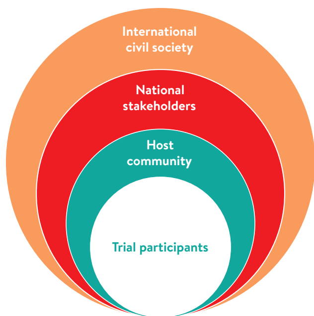
Fig. 6.1. Levels of community engagement

Scientists, researchers and other stakeholders involved in clinical trials have a critical role to play in how they engage and interact with the paediatric community. Even where the selection of community and community representatives is clear, the way they communicate, the language and scientific terms they use, how they perceive community involvement and their level of understanding can influence how the community engages in the research process (4).